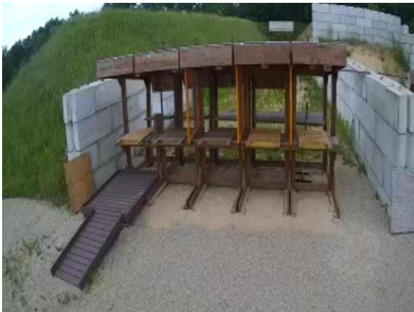
Rifle Range 100 Yard

Parking is available for using the ranges. In addition to the Parking Lot behind the clubhouse, you may park near the ranges in the designated areas. Please be aware, however, that driving your vehicle down to the ranges is at your own risk. RCRPC is not liable for any vehicle damage that might occur. Do not drive down the path marked for walking and cart access near the clubhouse as there are soft spots in that gravel that could be hazardous to regular vehicle traffic.