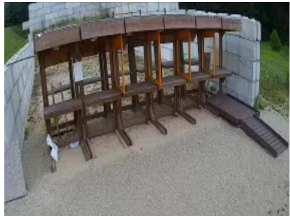
Pistol Range 50 Foot